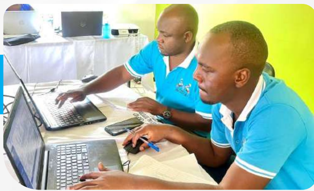
UNMC staff verifying online applications of Nurses and Midwives during UNMC online registration and licensure outreaches April to June 2024.