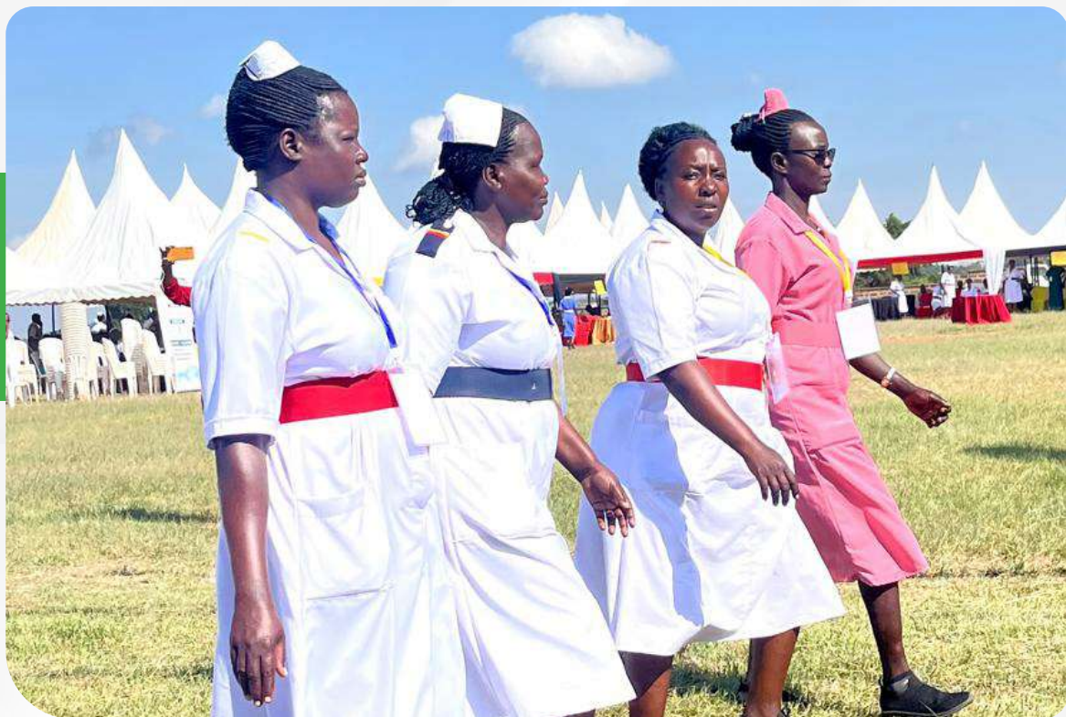
Nurses marching during the commemoration of International Nurses Day in Rukungiri

On 16th May 2024, a day before the celebrations, Nurses all over the country gathered at Immaculate Heart School in Rukungiri for a scientific conference and during the conference, UNMC made a presentation on the online registration and licensure system.