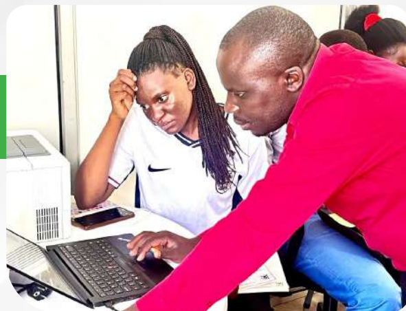
UNMC staff assisting a Nurse to renew her practicing license during an outreach in Masaka and Mubende