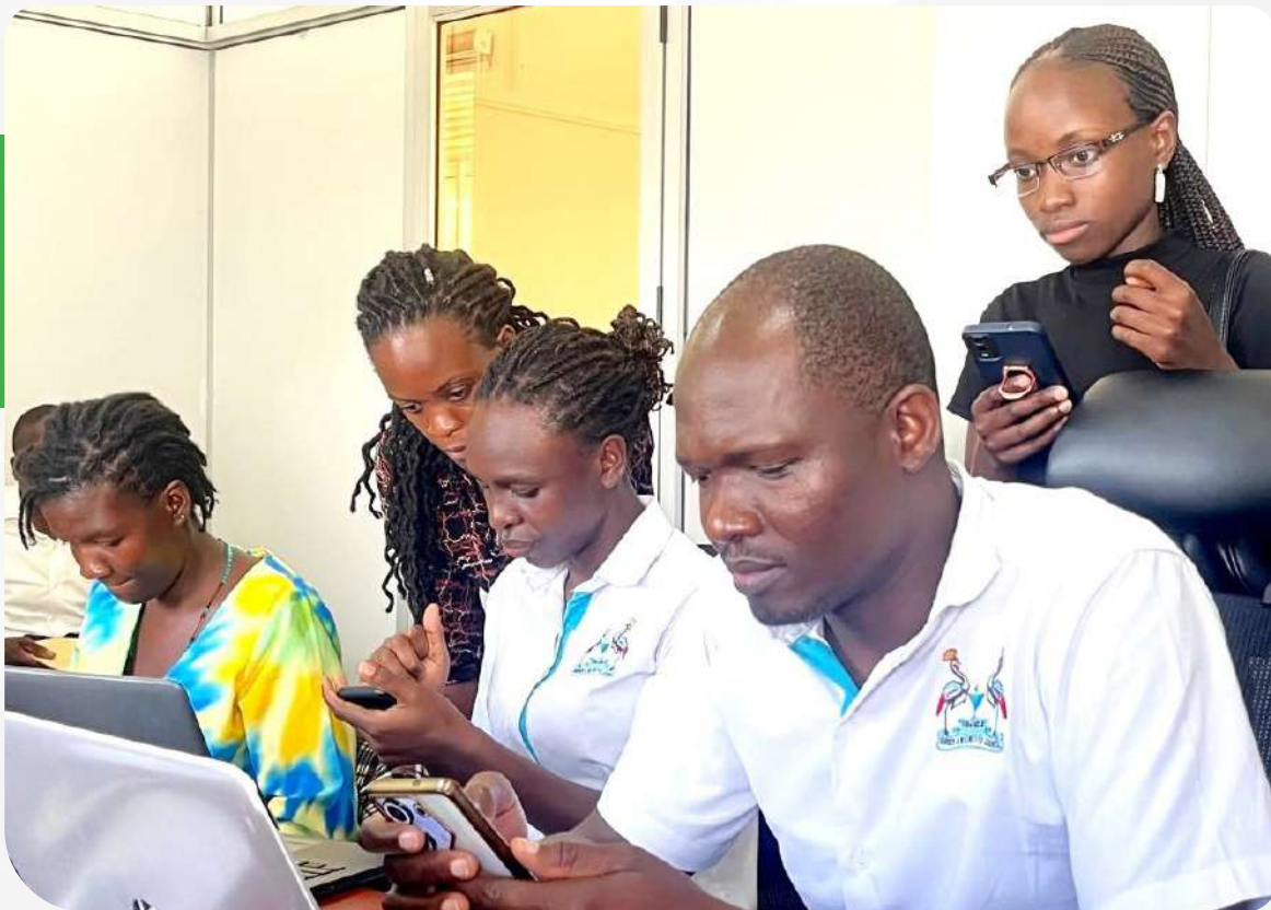
UNMC team assisting Nurses and Midwives to register during an outreach in Masaka Region at Masaka Regional Referral Hospital on 5th June 2024

A team from Uganda Nurses and Midwives Council (UNMC), comprising of the IT, Enrollment and Registration Officer, Inspectorate and Quality Assurance extended support to the Masaka and Mubende satellite centers from 4th to 7th June 2024 with technical support to ease the number of Nurses and Midwives that access the center for assistance, especially with the online registration and licensure system.