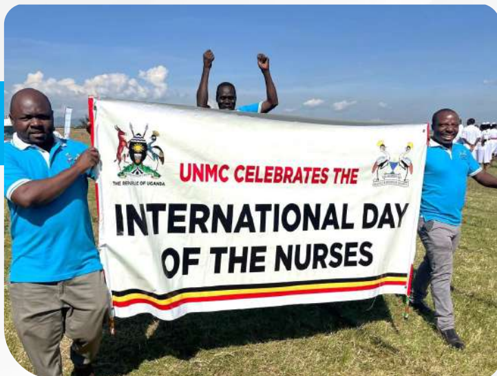
UNMC Staff Participate in the celebrations to mark the International Nurses Day in Rukungiri district