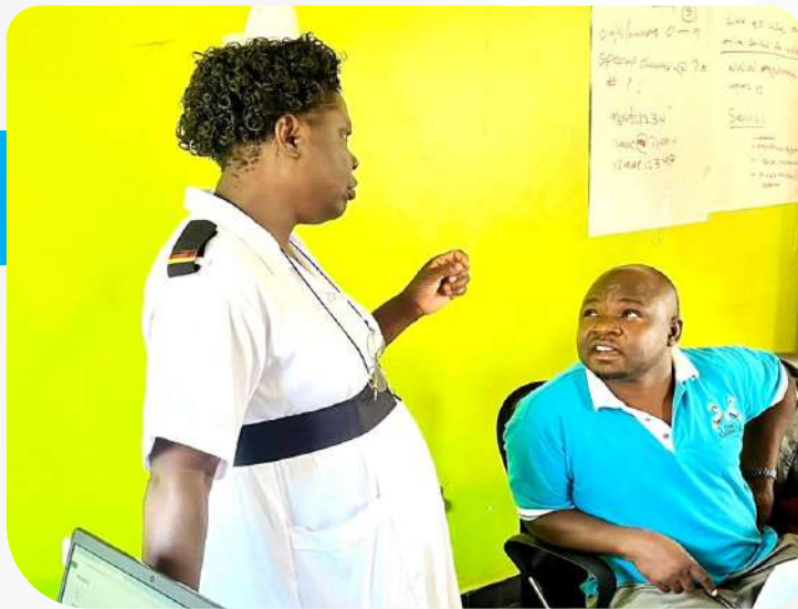
Satellite coordinate interacting with a UNMC staff during an outreach in Jinja City at Jinja Regional Referral Hospital