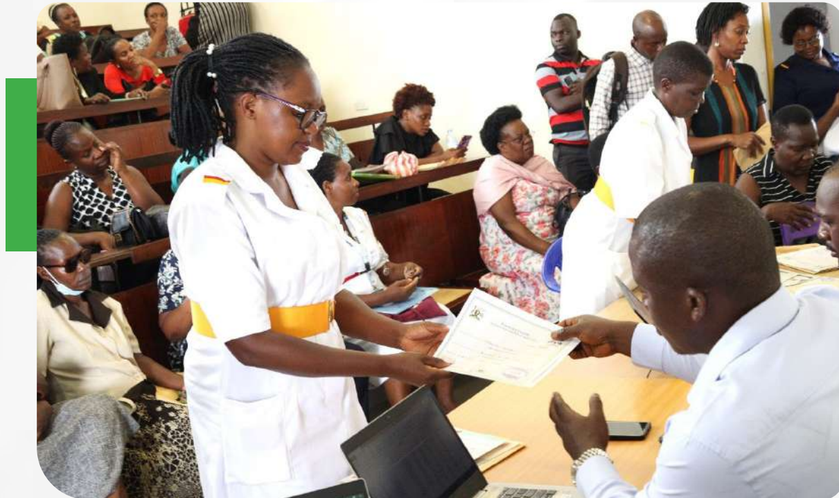
UNMC staff handing over a license to a Nurse after validation during a validation exercise at Mulago National Referral Hospital

On 27th to 31st May 2024, Uganda Nurses and Midwives Council (UNMC) conducted a validation exercise in Kampala for Nurses and Midwives working in the greater Mulago area, where critical institutions that employ most Nurses and Midwives are located. These include; Mulago Women's and Neonatal Specialized Hospital, Mulago National Referral Hospital, Baylor College Of Medicine Foundation Uganda, Mulago School Of Nursing And Midwifery, Nursing Department, Makerere University, Makerere University John Hopkins University (Mu-Jhu), Makerere University Joint Aids Program (Mjap), Infectious Disease Institute (Idi)-Uganda, Makerere University Walter Reed Project (Muwrp), Uganda Heart Institute, Uganda Cancer Institute, etc.