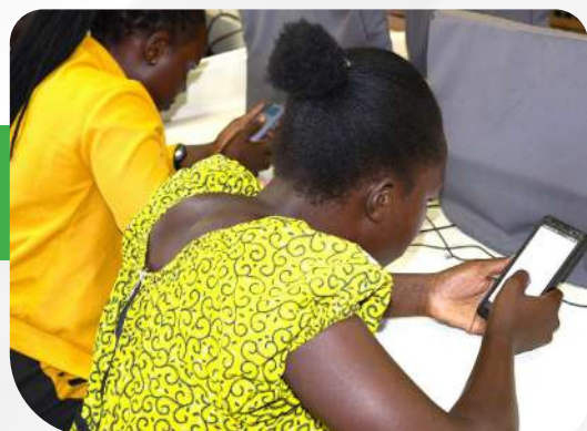
Nurse and Midwives using their phone to register and renew their practicing license during a UNMC outreach in West Nile, Acholi and Lango regions