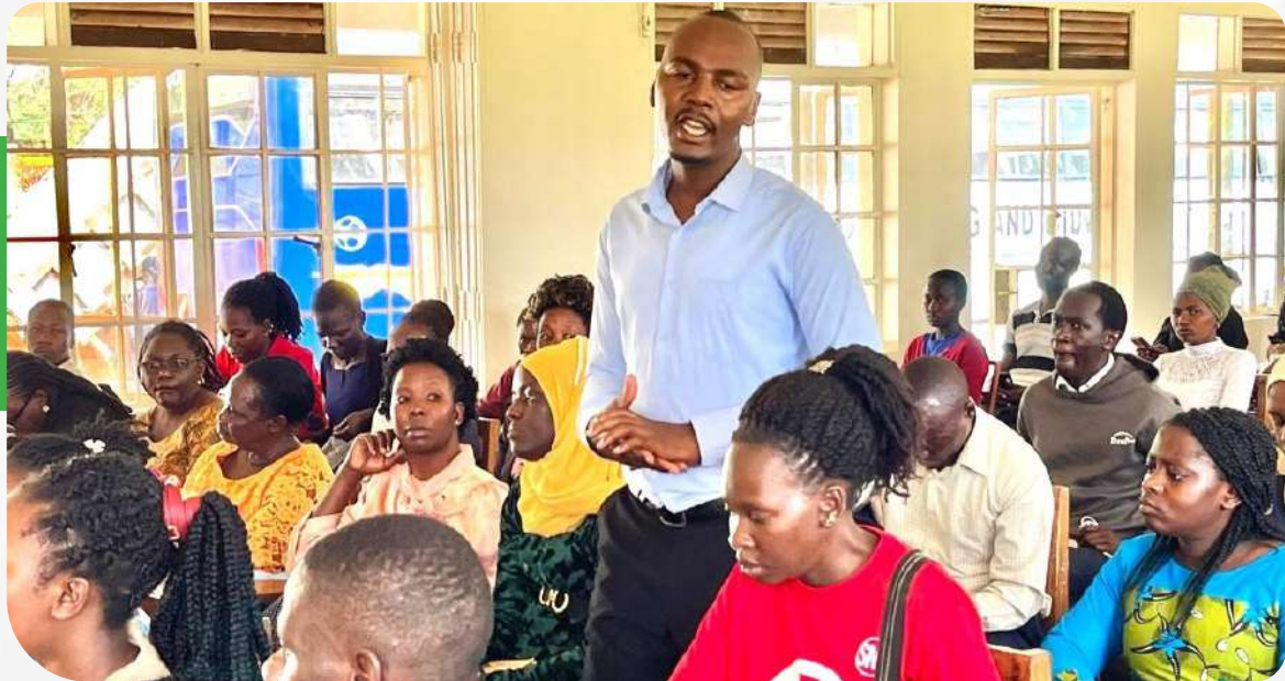
UNMC IT officer conducting a training on how to use the online system during an outreach in Mbale at Mbale School of Nursing

On 11th to 14th June 2024, Uganda Nurses and Midwives Council extended online registration and licensure services to Mbale and Jinja, where Nurses and Midwives in the surrounding areas were trained and assisted to register and renew their practicing licenses, using the UNMC online registration and licensure system.