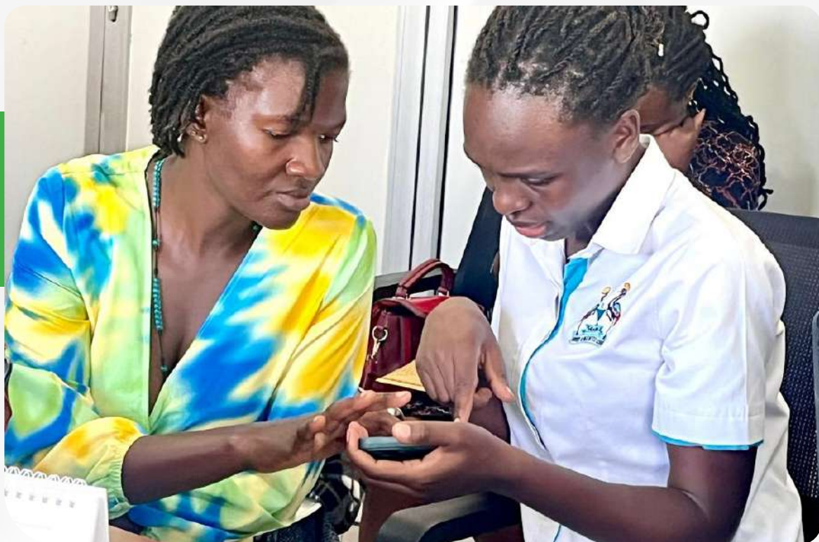
UNMC staff (right) assisting a Nurse register for a license using her phone during an outreach in Masaka

According to the activity report, 79 Nurses and Midwives were assisted during the outreach; 38 in Masaka and 41 in Mubende.