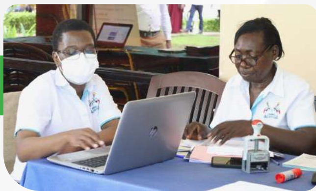
UNMC participates in activities to mark the international day of the Midwife that included a symposium, tree planting and exhibition.