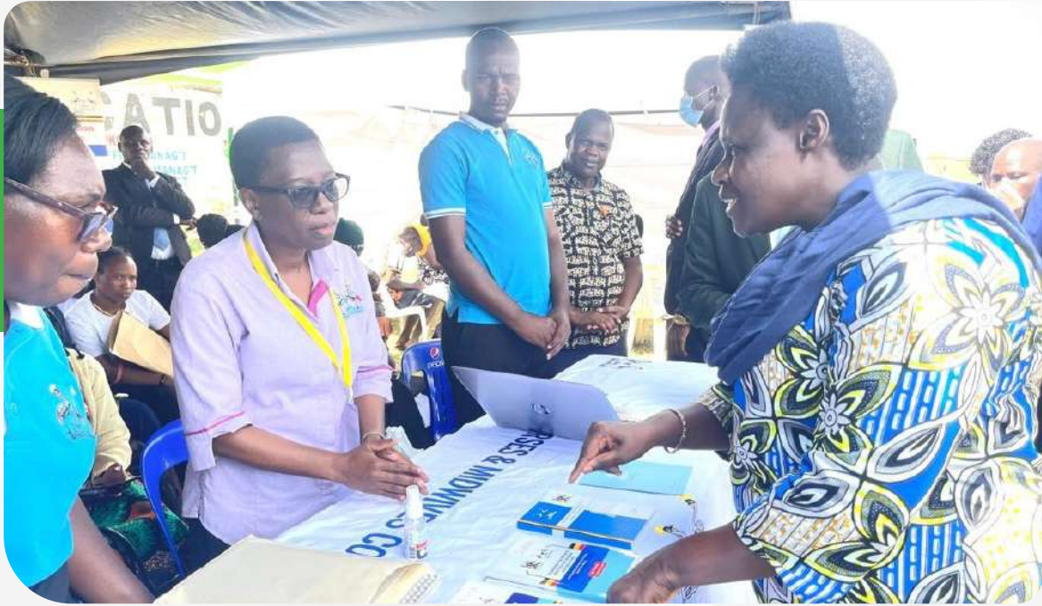
Vice president, H.E Major(RT) Jesca Alupo (right) inspecting UNMC exhibition stall during the celebrations of International Nurses Day in Rukungiri on 17th May 2024

H.E President Yoweri Museveni recognized and appreciated Uganda Nurses and Midwives Council (UNMC) for maintaining Professionalism within the Nursing and Midwifery Profession in Uganda. The President said this during the commemoration of International Nurses Day celebrations in Rukungiri district on 17th May 2024 in a speech that was read by the Vice President, H.E Major(Rt) Jessica Alupo.