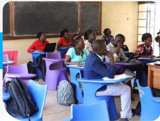
Nurses and Midwives participating in a manuscript coaching program organized by UNMC for Nurses and Midwives interested in doing research and contributing to the Uganda Journal of Nursing and Midwifery