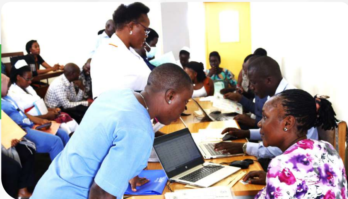
UNMC staff (right) interacting with a Nurse during the validation exercise

It is a requirement for a Nurse or Midwife to practice with valid academic documents in order to maintain Professional standards, and UNMC, a body responsible for regulating the Profession, time to time validates documents to ensure compliance.