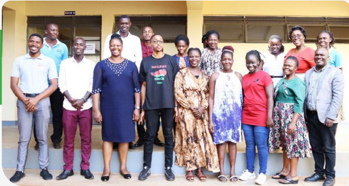
The Registrar, UNMC (third left) together with Nurses and Midwives after a four-day Manuscript coaching program

On Tuesday 28th May 2024, Uganda Nurses and Midwives Council (UNMC) started a four-day training for Nurses and Midwives who had shown interest in publishing with Uganda Journal of Nursing and Midwifery on how to write research papers and manuscripts. The coaching exercise took place from 28th to 31st May 2024 at Mulago School of Nursing and Midwifery.