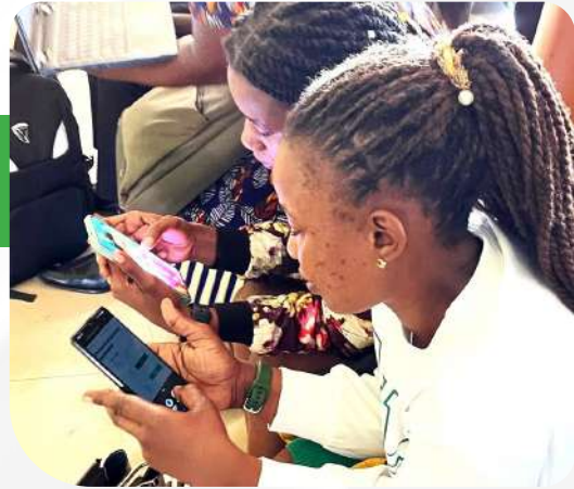
Newly qualified Nurses in Jinja accessing the UNMC online registration and licensure service on their mobile phones during an outreach in the region.